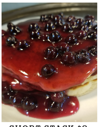
SHORT STACK $8

2 Pancakes Sprinkled with powdered sugar